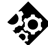
INDUSTRIAL & MANUFACTURING