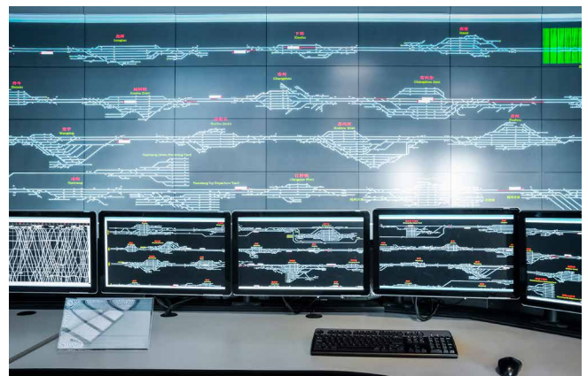
White Paper #2: Intelligent Control Rooms