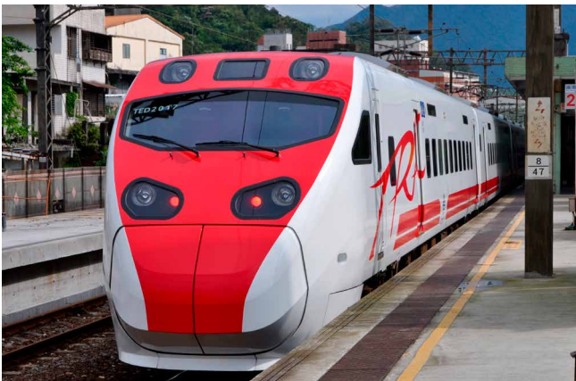
Case Study #1: Taiwan Railway, AlertWerks Wired

Interested, but not ready to call? No biggie. You might want to take a look at our case studies and white papers for more information.