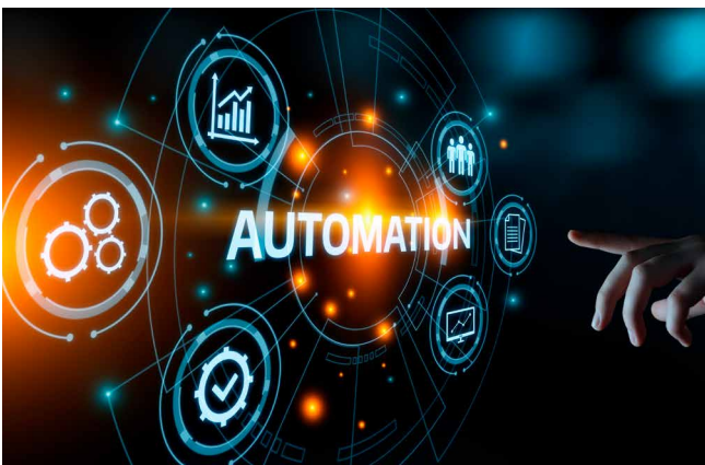
White Paper #1: Benefits of Using Physical and Virtual Sensors for Automation