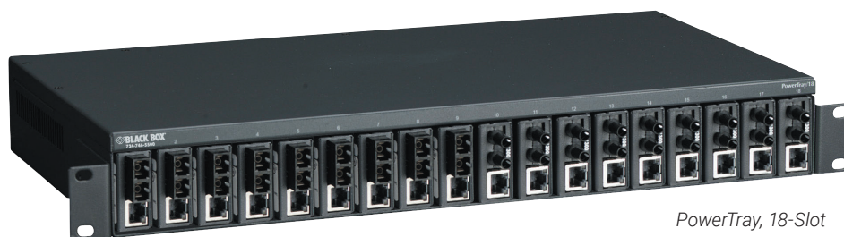
PowerTray, 18-Slot (LHC018A-AC-R2)

Optionally, you can mount up to 18 Multipower Miniature Media Converters in the PowerTray (part number LHC018A-AC-R2, shown below).