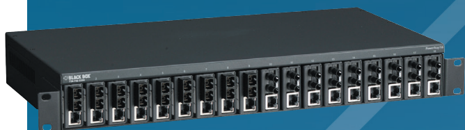
Power Tray (LHC018A-AC-R2) filled with Industrial MultiPower Media Converters.