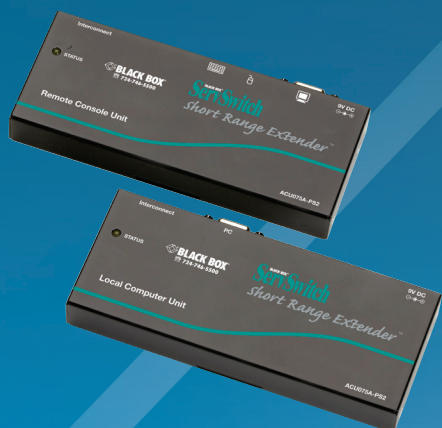
ACU075A-PS2: front view: top: Console Unit; bottom: Computer Unit