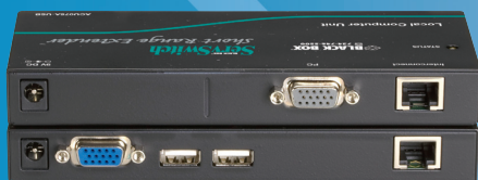
ACU075A-USB: back view: top: Computer Unit; bottom: Console Unit