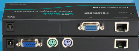
ACU075A-PS2: back view: top: Computer Unit; bottom: Console Unit