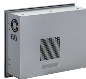
▲ Back view