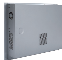
▲ Less screw design