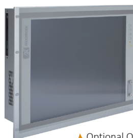
▲ Optional ODD Drive