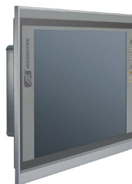
▲ Ultra-slim mechanism design