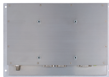
▲ Raer view