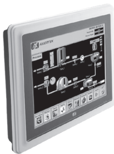
▲ Side view