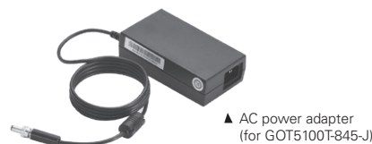
▲ AC power adapter (for GOT5100T-845-J)

Windows® 7 Windows® 8.1 (64-bit) Windows® 10