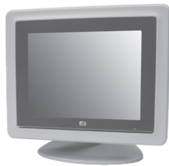
▲ Desktop stand