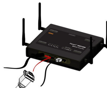
Connect to host PC (Console Port)