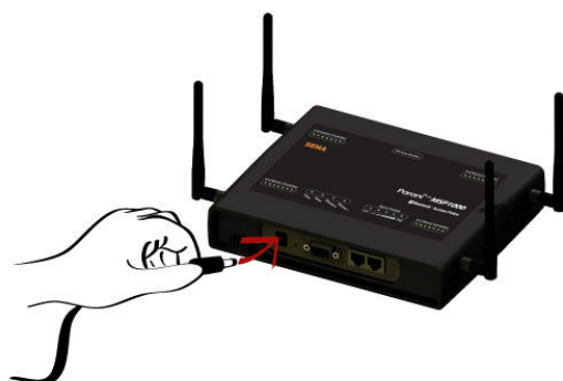
Connect Power supply