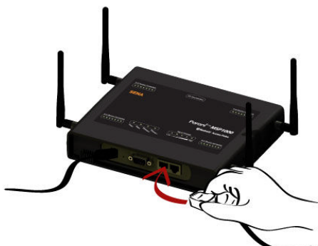
Connect Ethernet cable (ETH 0 Port)