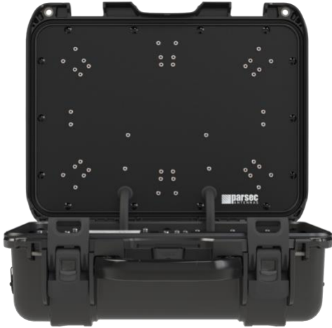
Hinge Door for Easy Router Access