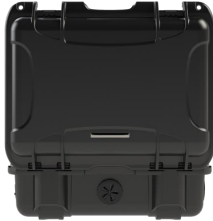
Quick Battery Access