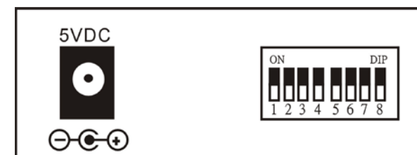
Figure 3. Media Converter Series Rear Panel